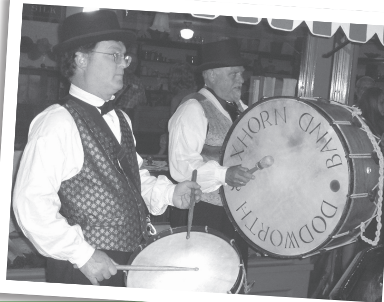
The Dodworth Saxhorn Band provided a taste of Americana with their spirited music in the Streets of Old Detroit during Seven Days Seven Stories, the Society's weeklong celebration of Detroit's 310th birthday.