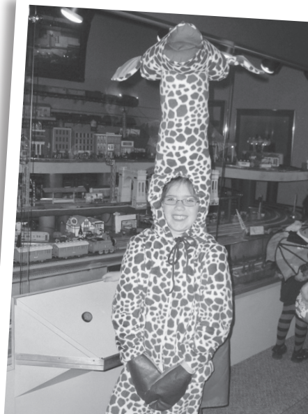
This young lady dressed as a giraffe enjoyed the Glancy Trains exhibit during the Society's annual Treats in the Streets Halloween-themed event at the Detroit Historical Museum.