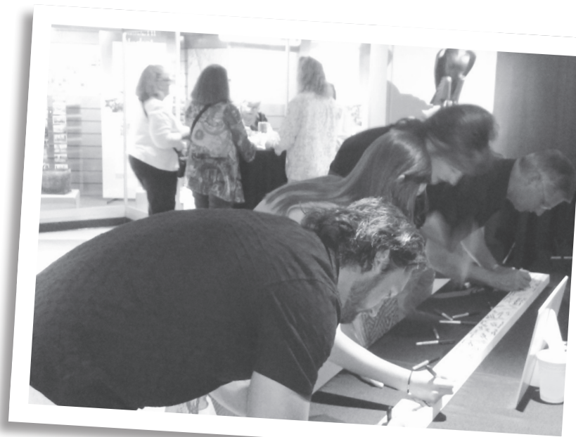
Members attending the Detroit Historical Museum's closure party in May had the opportunity to sign a 2 x 4 which has subsequently been placed into the infrastructure of the upcoming Gallery of Innovation exhibit on the second floor.