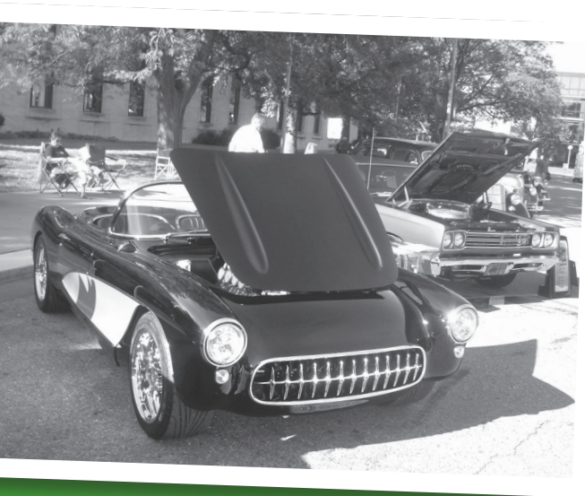
The Society hosted a classic car show in July as part of the celebration of Detroit's 310th birthday.